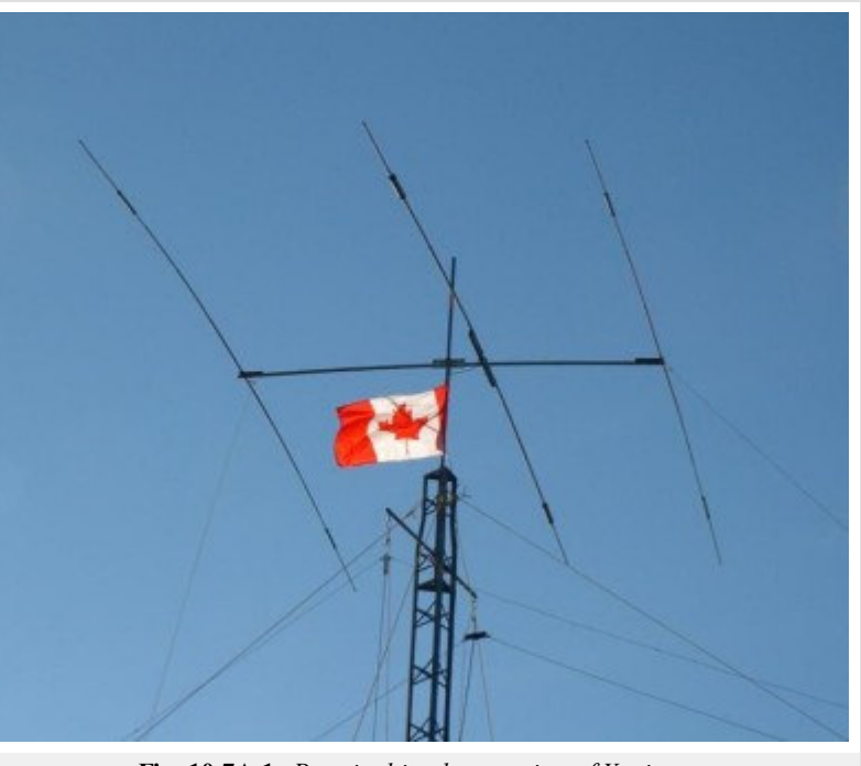
Fig. 10.7A.1 Practical implementation of Yagi antenna

Yagi-Uda antennas are directional along the axis perpendicular to the dipole in the plane of the elements, from the reflector through the driven element and out via the director(s). Typically, all elements are arranged at approximately a one-quarter-wavelength mutual spacing. All elements usually lie in the same plane,